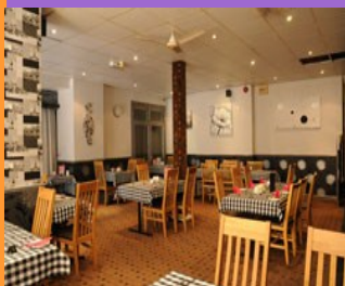
Dining area at The Bond Hotel, Blackpool