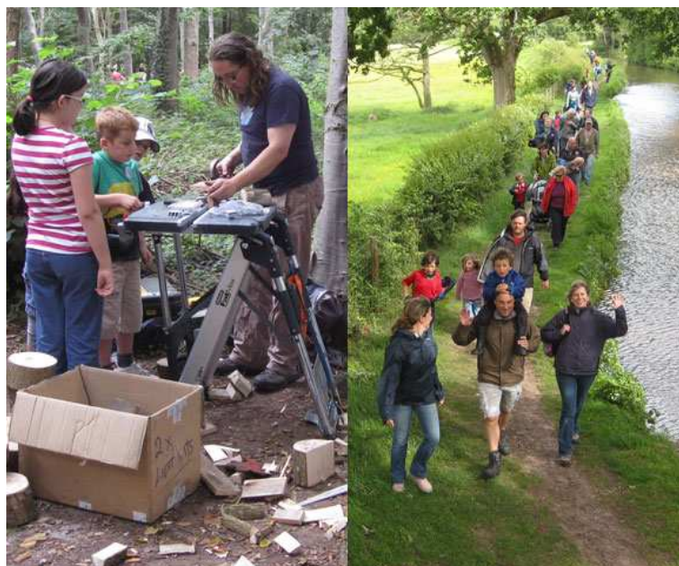
2011's Fun Day and Sunday Stroll were a big success for the woodland group

WOODLANDS - Thanks to the hard work and commitment of our growing band of volunteers, the woodland group continues to go from strength to strength. 2011 was an important year for us as we made a big step towards sustainability by starting to sell our firewood locally. We also ran two very enjoyable public events - a Sunday Stroll & Sausage Sizzle in May, and a Woodland Family Fun Day in August. Both were very well attended and we plan to make these a regular part of the village calendar. For 2012, we're hoping to build on this success with a paid volunteer coordinator (pending funding approval from Environment Wales). This will strengthen the group further, providing valuable training and support for our dedicated volunteers and ensuring we make the most of the woodlands we manage.